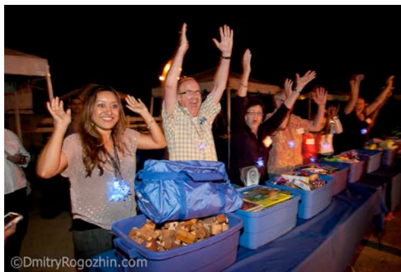
Guests have fun stuffing bags as fast as possible, one of the many games at the evening's event

The 4 th Annual Event was held at the Leonis Adobe Museum in Calabasas, CA.