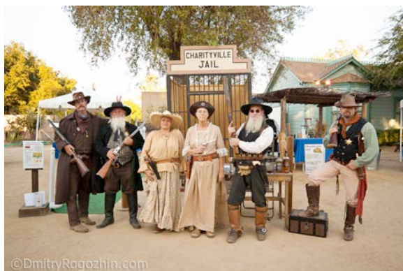
Charityville Jail joined us for some western style entertainment