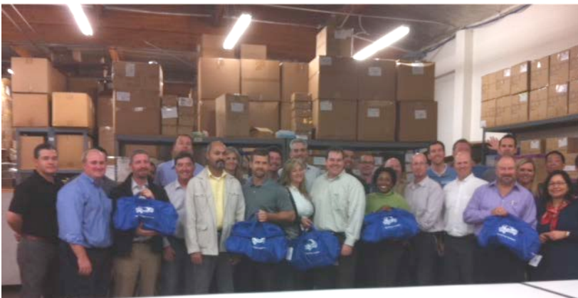
Amgen Employees visited us for the afternoon, stuffing hundreds of My Stuff Bags.