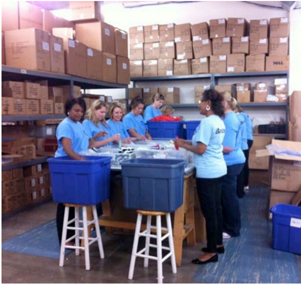
Baxter employees joined us for a day of stuffing bags.